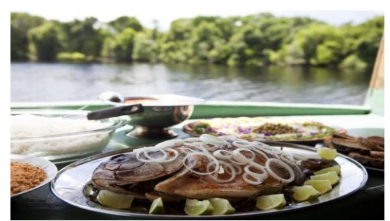
Tambaqui assado na brasa