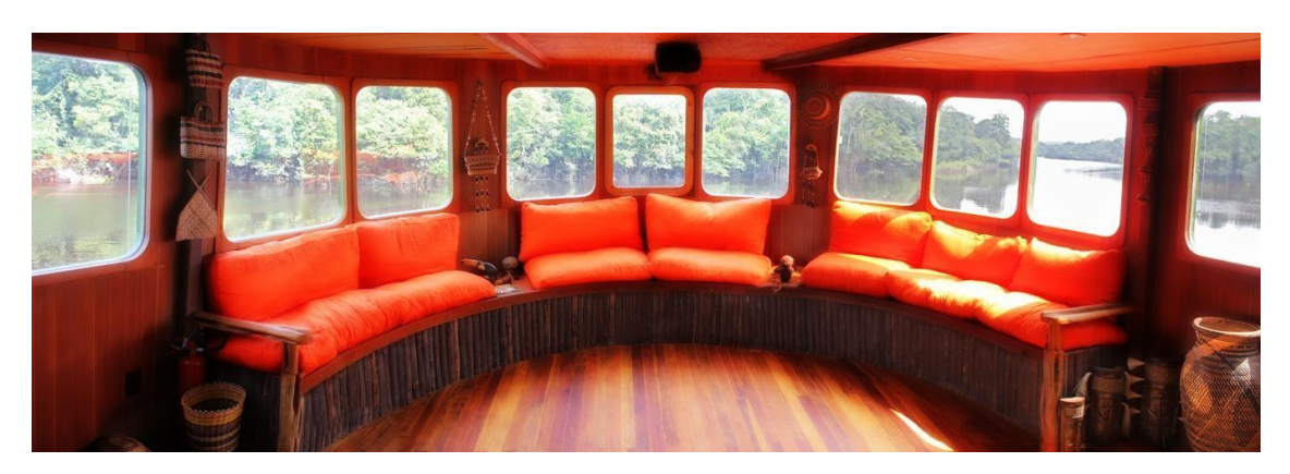
For groups with up to 7 passengers, the departure is made with the Jacaré-Tinga vessel. With 8 or more passengers, in the Jacaré-Açu vessel.