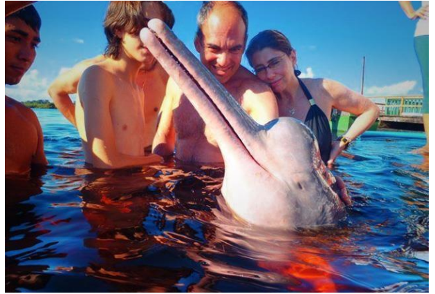
Swimming with Pink Dolphins