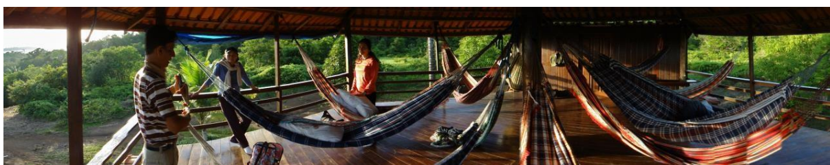
Madada lookout bungalow, for an overnight in the jungle (optional included)