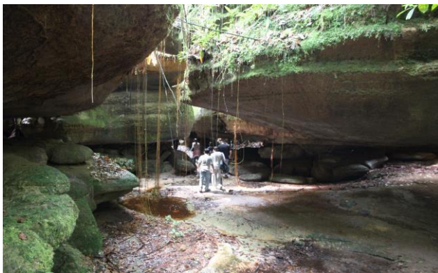
Saloon from Madada Caves