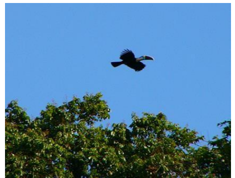
Toucan in Anavilhanas

Note: We request that the client bring a pen drive for the files.