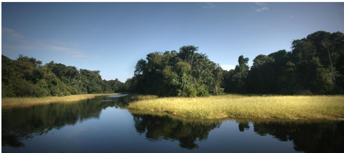
Lakes from Anavilhanas Archipelago