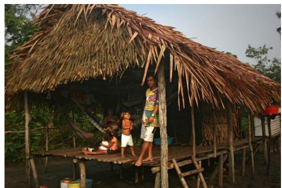
Tapiri, the native amazon house.