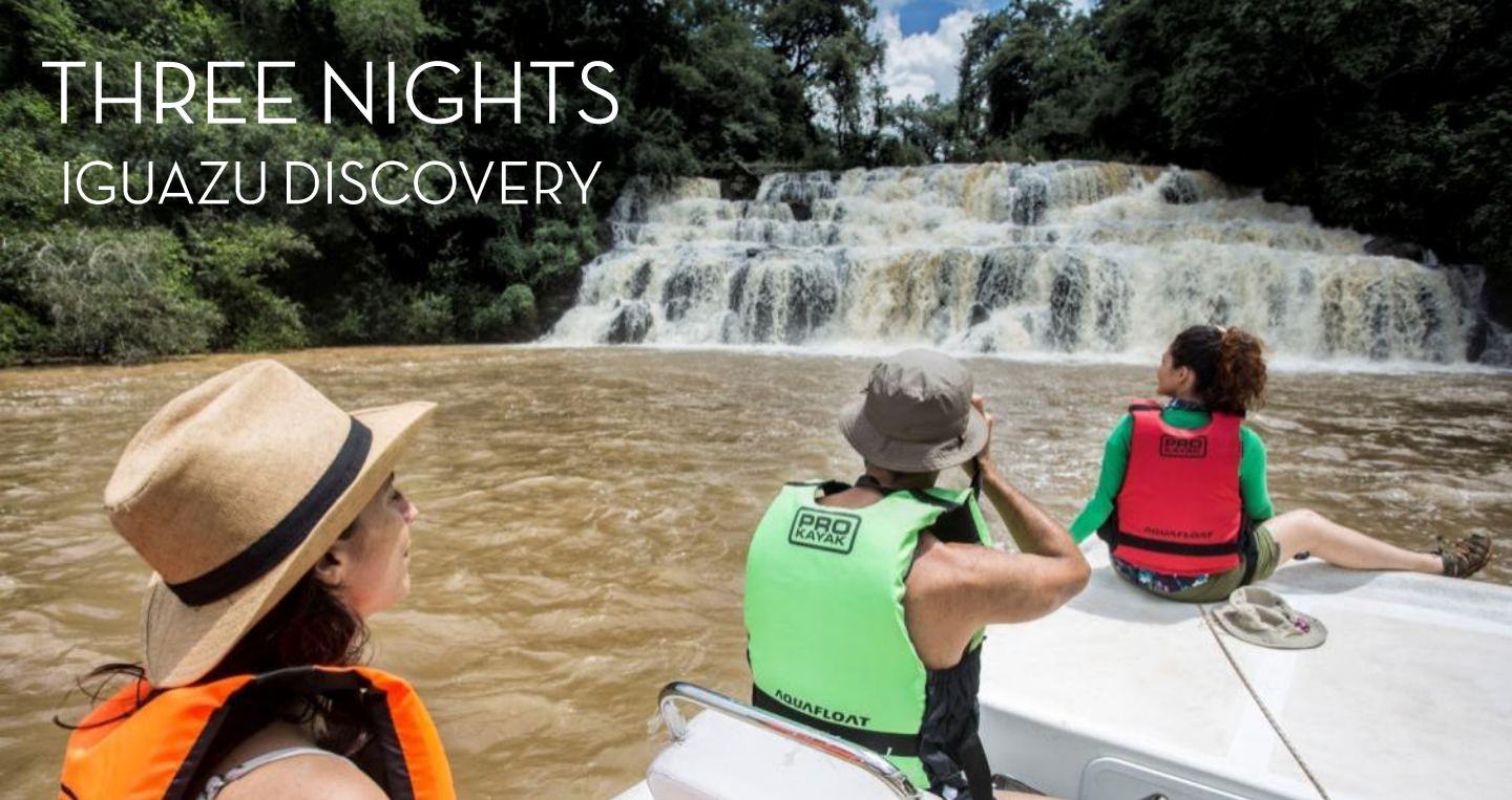
Yasi Waterfall & Alto Parana