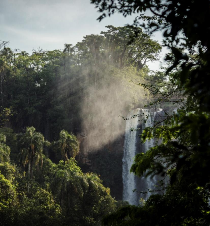
See the Iguazú Waterfalls from Argentina and Brasil