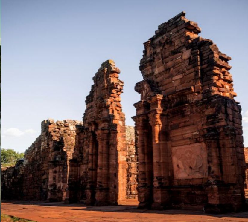
The Jesuit Ruins of San Ignacio, Loreto and Santa Ana