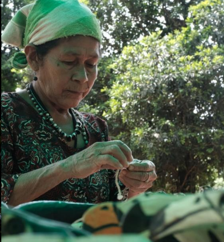
Visit a Guarani settlement