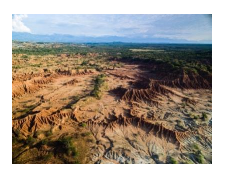
Meals: (B/L/-) Hotel: GHL Hotel Neiva or similar

After Breakfast, you will be taken to Villavieja town where you will visit the red area of Tatacoa desert, which holds important paleontological secrets of the country. After lunch, you will have a 30 minutes boat tour on the Magdalena River looking for fauna and listening to myths and legends., we will end the day back in Neiva.