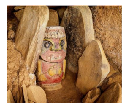
Meals: (B/L/-) Hotel: Hosteria Coconuco Comfandi

On this day, you will start at 8:00 AM visiting some of the most beautiful statues of the whole region, located at La Pelota and Purutal sites. These statues still keep the original colors that the civilization used. In the afternoon you will be taken in a 3-hours transfer to the municipality of Coconuco, located next to Puracé national park.