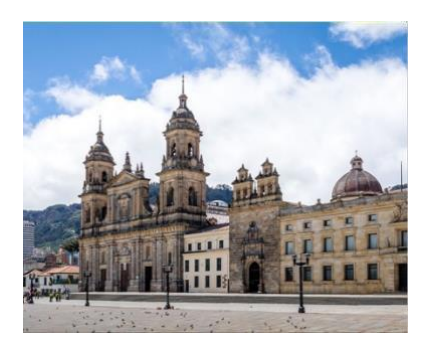
Meals: (-/-/-) Hotel: Hotel de La Opera or similar

We will pick you up at El Dorado Airport and will take you to the hotel. At night, a person from our team will give you a briefing of the whole experience with some advices and recommendations for a pleasant trip. Subsequently, you will have time for dinner and rest.