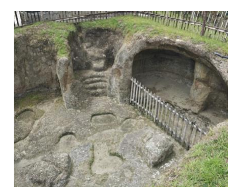
Meals: (B/L/-) Hotel: GHL Hotel Neiva or similar

Breakfast and after that a tour in private transportation to several sites, visiting different hypogea sites such as El Duende and Tablón hills, having a typical lunch. You will also visit small villages where you will see old churches and buildings surrounded by great landscapes. In the afternoon you will be taken to the city of Neiva.