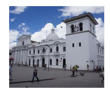
Meals: (B/L/-) Hotel: Monasterio hotel or similar

On this day, you will have at 9:00 AM a city-tour with our bilingual guide, exploring the beautiful historical center of Popayán, which is called the white city as its buildings preserve this color. In the afternoon, you will be taken to "Hacienda Calibio", where with our guide you can learn about the history from the colonists' perspective and then will be taken back to the hotel.