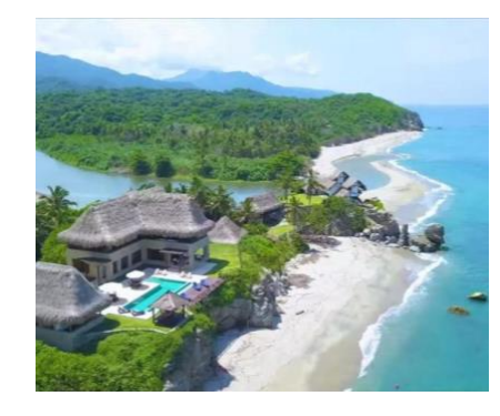
Meals: (B/-/-) Hotel: Villa María / Casa Linda Los Naranjos or similar

On this day, you will have a transfer to be at the airport 2 hours before your flight at the airport where you will fly to Santa Marta. Once there, you will have a 1-hour transfer from the airport to your ecolodge located next to Tayrona National. Your hotel has a great pool and it is next to a pristine beach that you can enjoy in the afternoon.