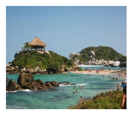
Meals: (B/L/-) Hotel: Casa de Leda or similar

On this day, you will start a guided trek at 8:00 AM from your hotel around the national park, its rocky landscapes and its wild beaches. With some luck you can observe some fauna on the way and will see the unique scenery of this place. In the afternoon, you will be taken back to Santa Marta.