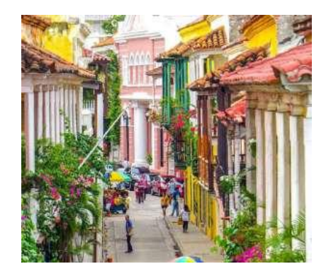
Meals: (B/L/-) Hotel: Sophia hotel or similar

On this day, you will be picked up at 8:00 AM and will have a 4.5hours transfer to Cartagena. We will drop you at the chosen hotel inside the walled city. In the afternoon, you will have a 4-hours citytour, visiting the main spots of the city of Cartagena, which has a strong heritage of Spanish architecture mixed with the colors and vibes of Caribbean vibes.