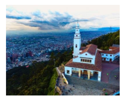
Meals : (B/L/-) Hotel: Hotel de La Opera or similar

On this day, after breakfast, you will have a full day city-tour of 7 hours approx., starting at 9:00 AM at the lobby of the hotel (the hour can change if you need more recover from the international flight), where you will visit the most iconic spots of the capital of Colombia, such as La Candelaria neighborhood, Monserrate church and the gold museum of Bogota. At the end of afternoon, you will be taken back to the hotel