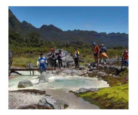
Meals: (B/L/-) Hotel: Monasterio hotel or similar

After breakfast, you will start exploring the main attractions of the Puracé National Park at 8:00 AM by car, where you can see different waterfalls, hotsprings, well preserved ecosystems up to 3.000 m.a.s.l. and even the Andean condor, all of that in an indigenous territory. In the afternoon you will be taken in a 1.5-hour transfer to the city of Popayán.