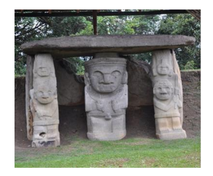
Meals: (B/L/-) Hotel: Akawanka lodge or similar

After breakfast, you will be taken to be at the airport 2 hours before your flight, and will fly directly to Pitalito (11:02–12:23). Once there, you will be picked up and will have a 30 minutes transfer to your hotel in San Agustin. You will have lunch, and after that, you will have a tour at the Archeological Park with our bilingual guide, discovering the first statues of the region. At night you will be taken back to the hotel.