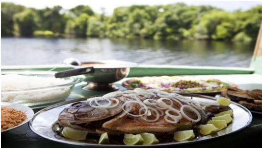
Tambaqui assado na brasa